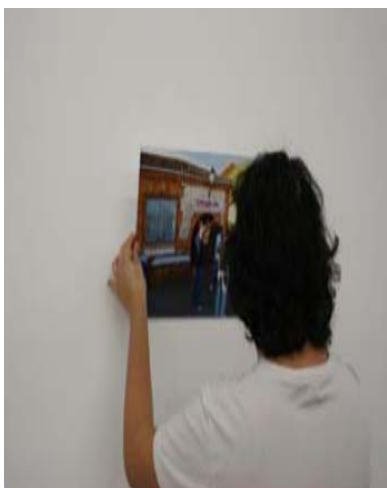
Figure 2: Firstly place your photo on the wall.

Our participants have organized a photo exhibition in the new Day Centre that INTRAS has just opened in Valladolid.