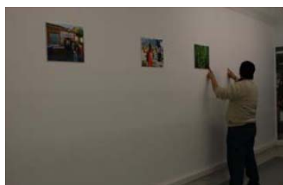
Figure 3: Make sure that all the photos are in their place and take a general look at them. Is everything ok?

The exhibition was composed by the photos that our pupils are making within the activities of the Youth Citizen Journalism project, so they were both the artists and the staff in charge of organizing the exhibition.